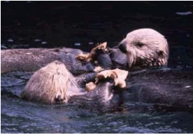
For more information and to see other photos: http://www.jji.org/volumes/volume2/issue1/features/photos.html .